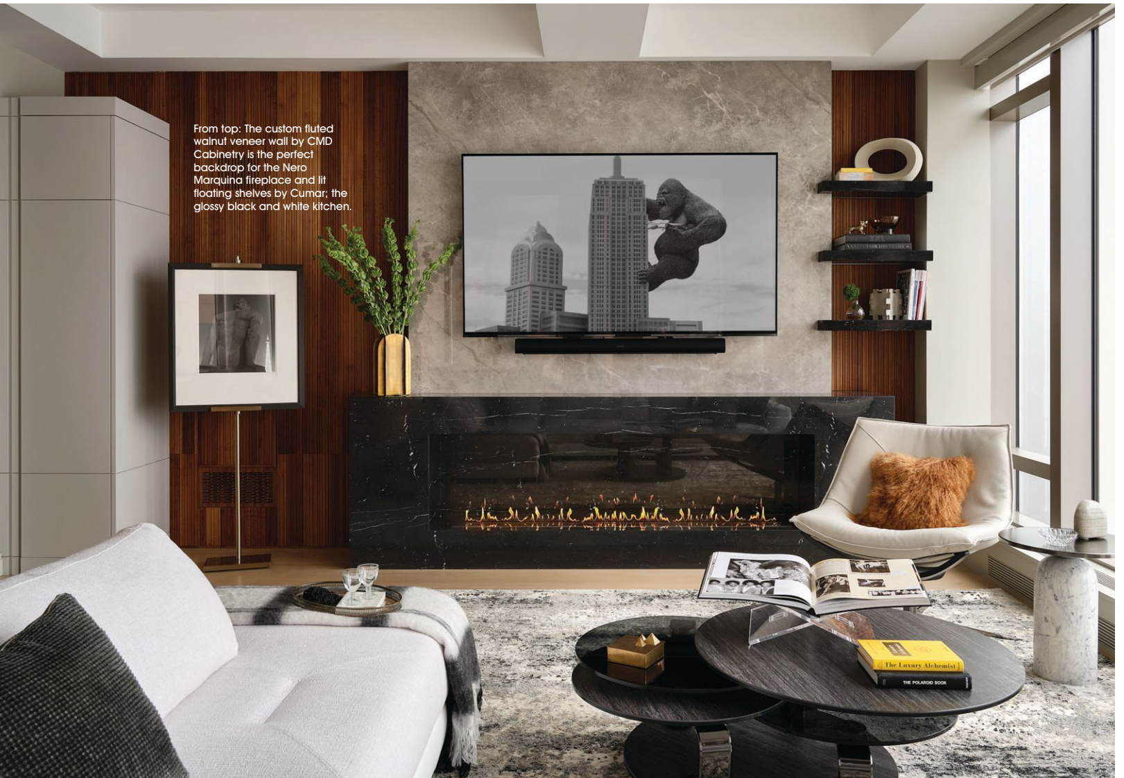
From top: The custom fluted walnut veneer wall by CMD Cabinetry is the perfect backdrop for the Nero Marquina fireplace and lit floating shelves by Cumar; the glossy black and white kitchen.