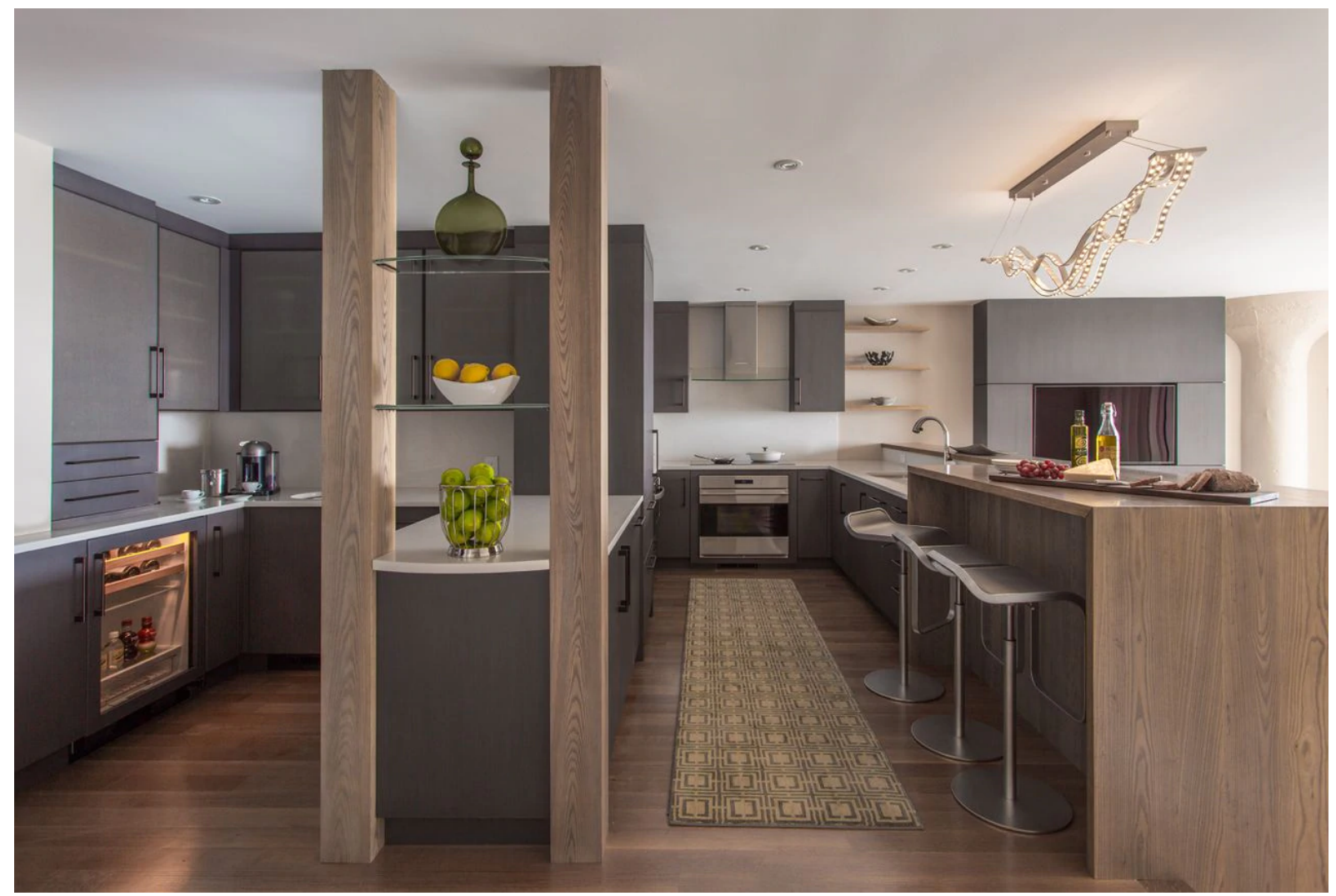
ELEVEN INTERIORS PHOTOS