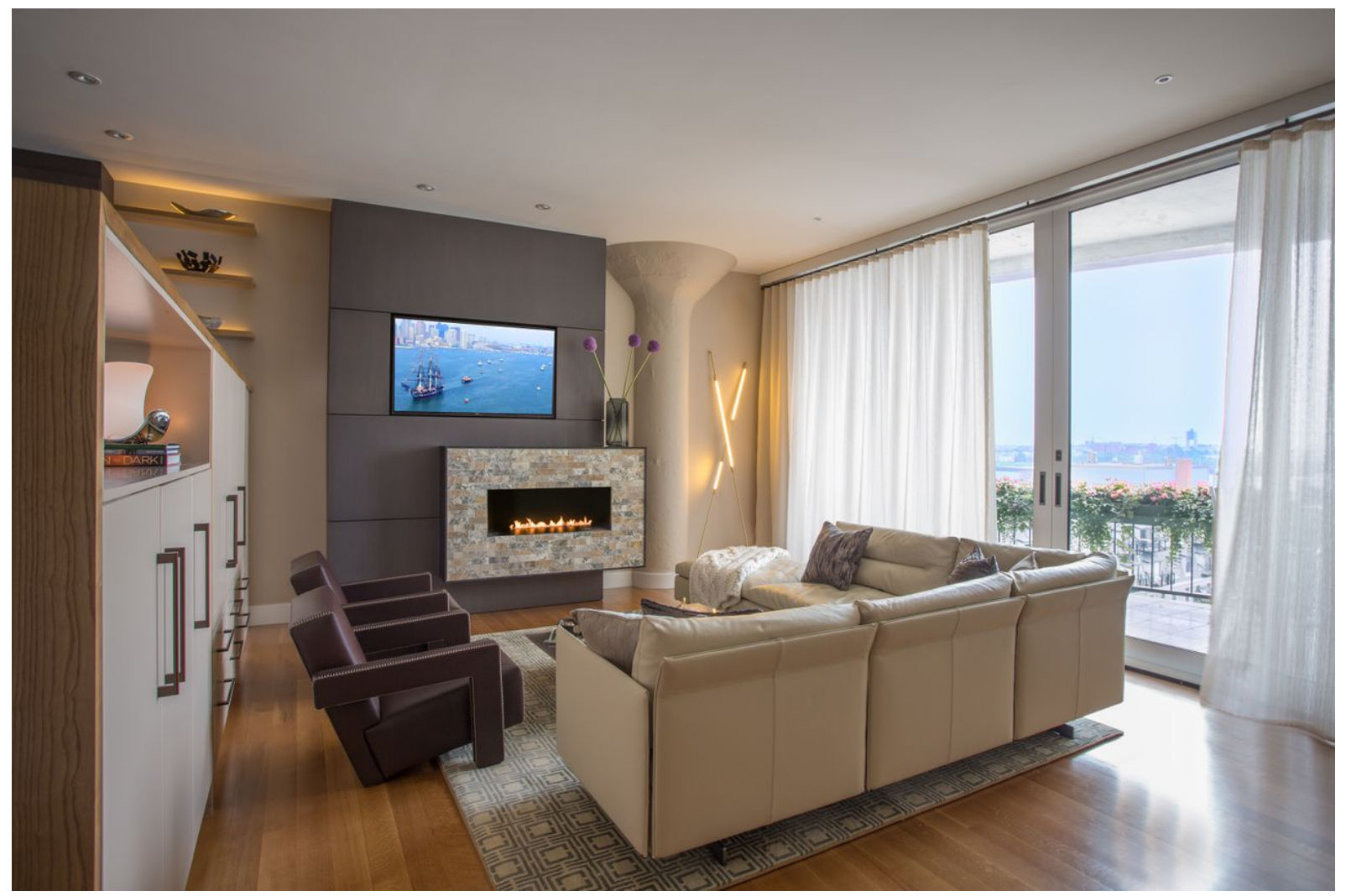
ELEVEN INTERIORS PHOTOS

When the owners entertain, the area functions as a wet bar. The adjacent peninsula is raised and made of blackened walnut, and metal Lem Piston stools have a contemporary vibe.